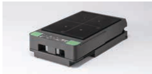
RICOH Tray for Standard Size Type 1 (A4)