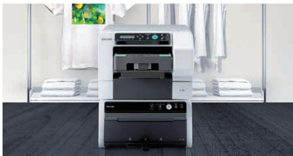
* RICOH Ri 100 printer with the RICOH Rh 100 finisher option.

The RICOH Ri 100 can fit into a space as small as 399 x 698 mm, making it one of the smallest DTG printers. The printer and its finisher can be stacked to maximize functionality without sacrificing space.