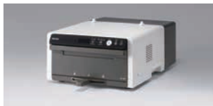
RICOH Rh 100 Finisher