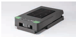
RICOH Tray for Small Size Type 1 (A5)