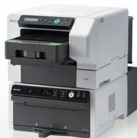
* RICOH Ri 100 printer with the RICOH Rh 100 finisher option.