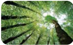
Paper Reduction Reduce, Reuse, Recycle

Our commitment to social responsibility is woven into our corporate DNA, and it has always been part of the Ricoh way – the foundation of all our business activities.