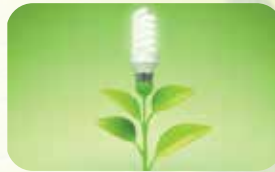
Energy Efficiency Innovative Quick Start-Up (QSUI Technology)